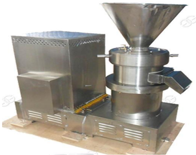
Cocoa liquor machine

1) Cocoa mass or liquor- The dried beans are cleaned and roasted uniformly to get the desired aroma. The roasted beans are broken and winnowed to get good nibs(cotyledons). When these nibs are ground using a boll mill crusher or grinding machine, cocoa liquor or cocoa mass is obtained. There are two types of cocoa mass-natural mass and alkaline mass.