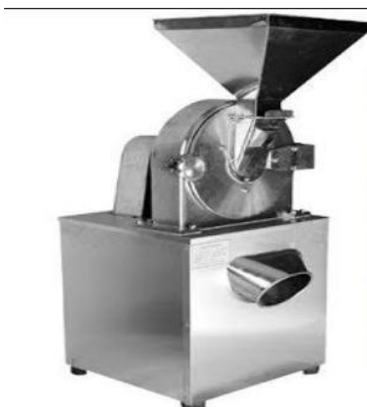
Cocoa grinding machine

3) Cocoa powder- The solid blocks of compressed cocoa remaining after the extraction of cocoa butter are pulverised into a fine powder called cocoa powder-high fat powder containing 20-25% of fat which is used in drinks and low fat powder containing 10-13% of fat and is used in cakes, biscuits, ice-creams and other chocolate flavoured products.